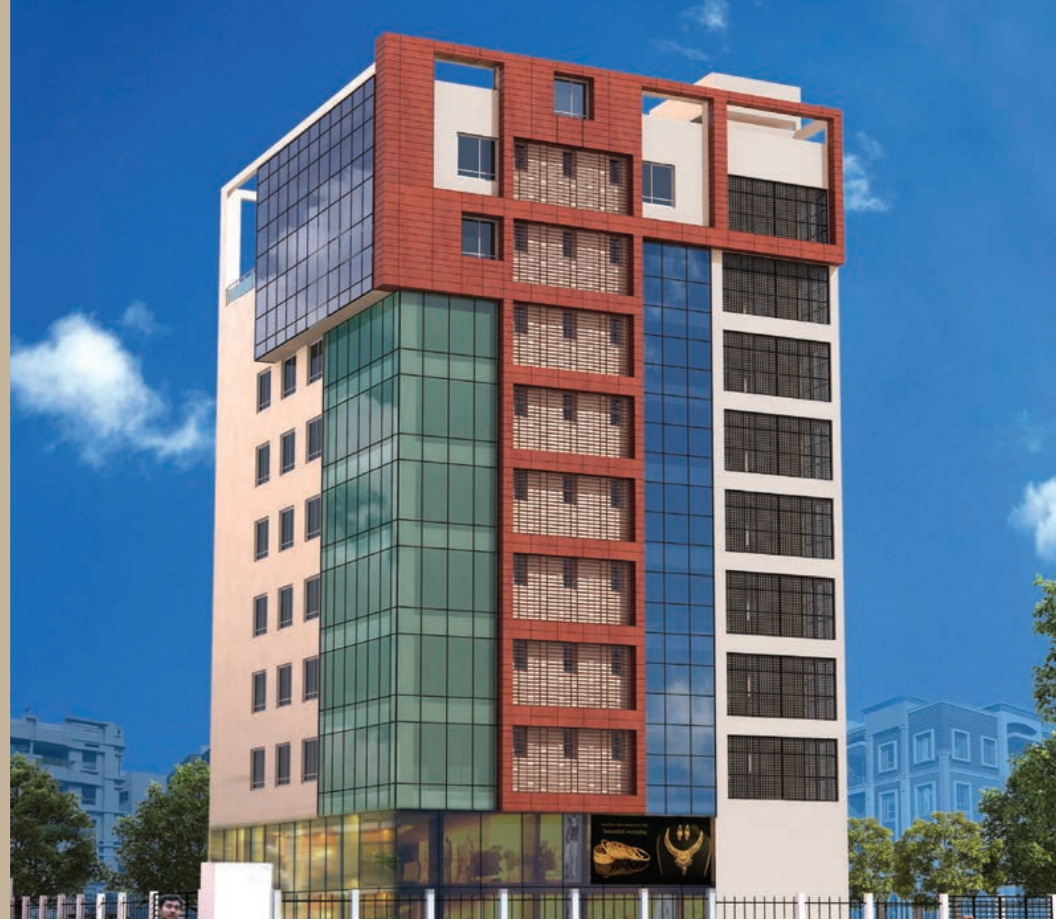
RSH Chambers, Camac Street, Kolkata

From here everything is around the corner