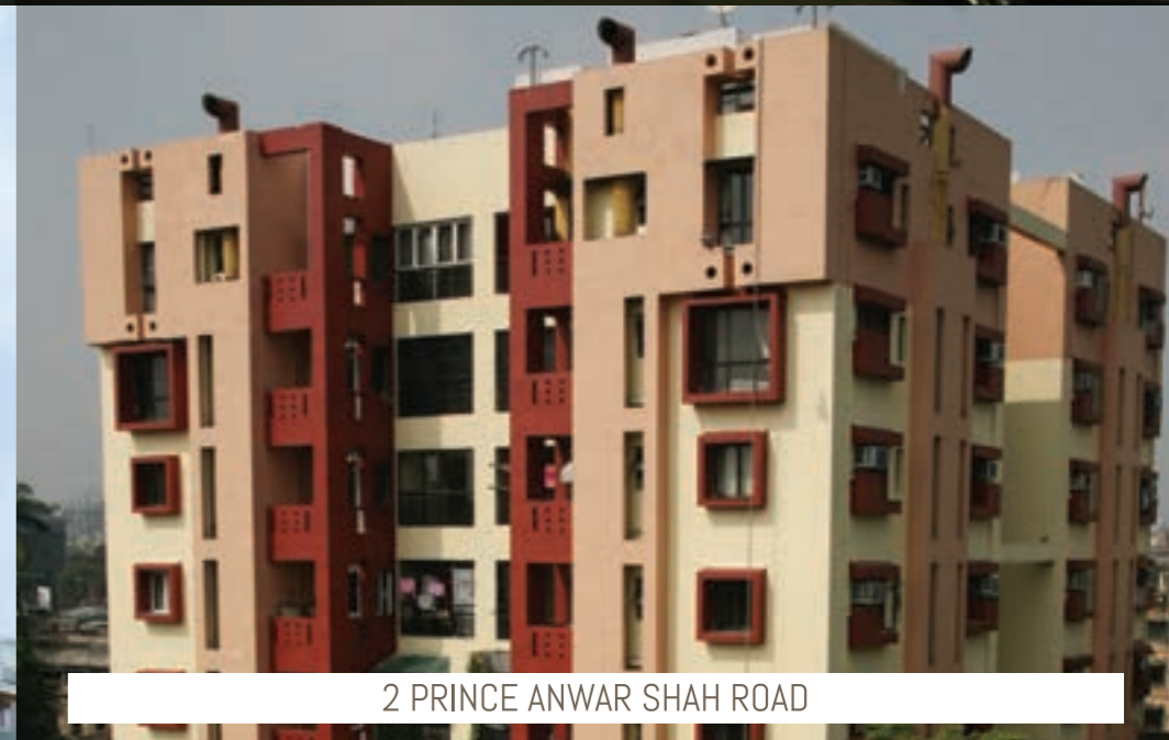
2 PRINCE ANWAR SHAH ROAD