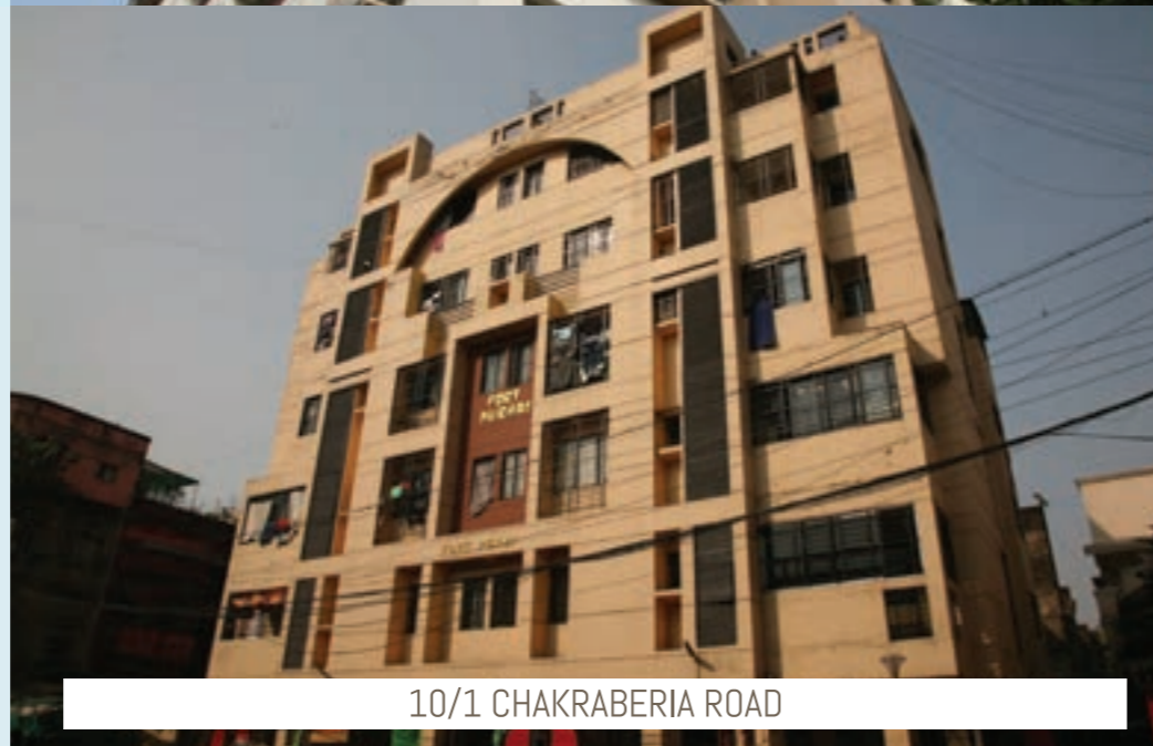
10/1 CHAKRABERIA ROAD