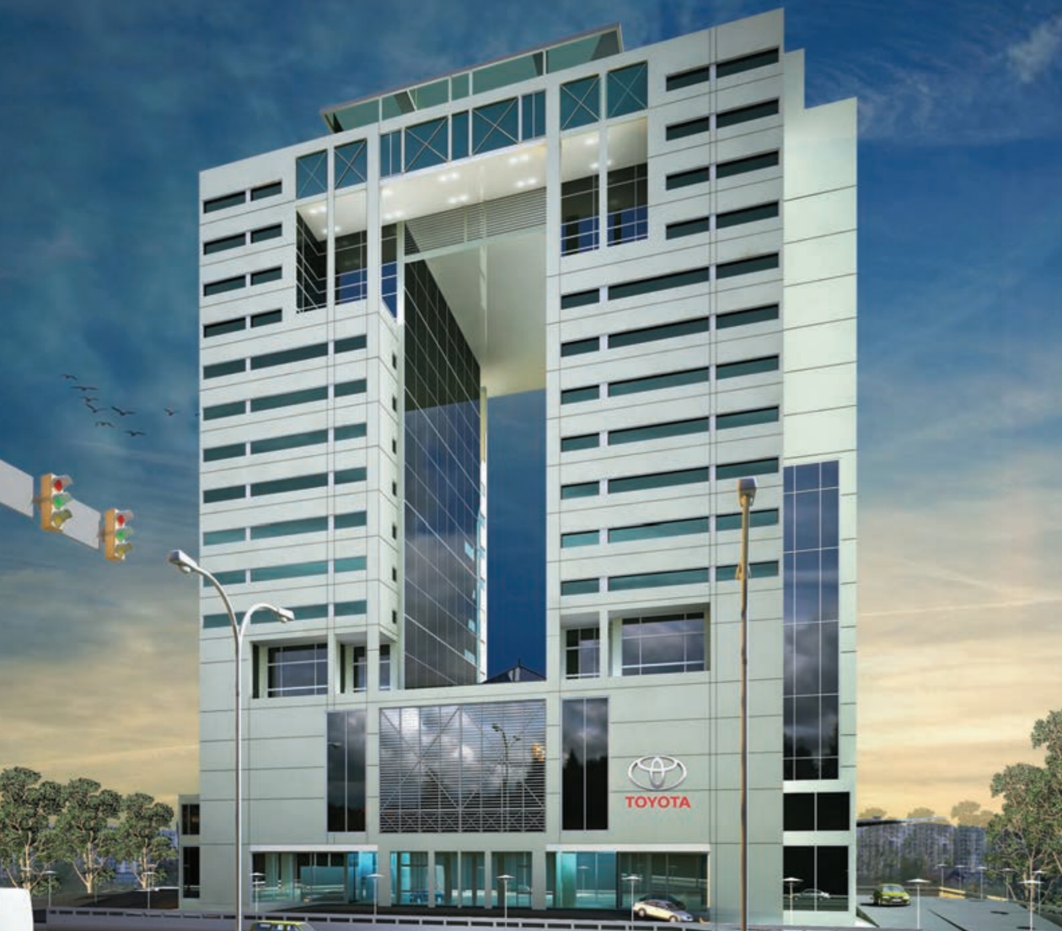
Crest, New Town

A word that's used with caution Only apt to describe Crest