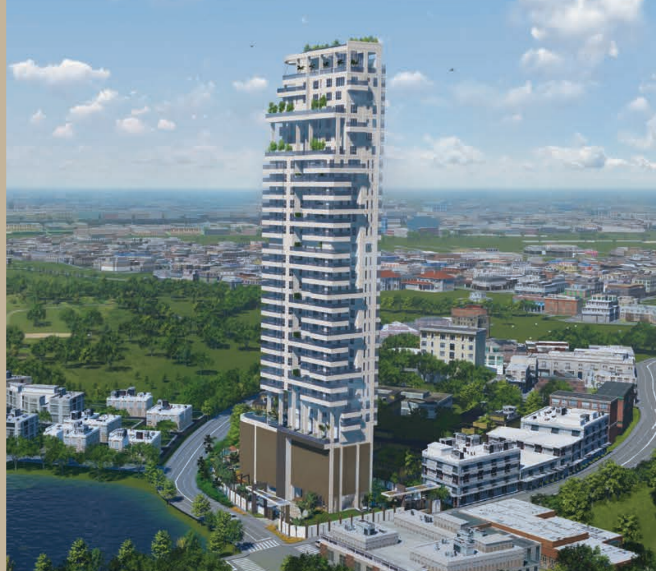
RSH Signature, Golf Green

RSH Signature has been awarded with a Pre-certified Platinum Rating by IGBC for Green Homes