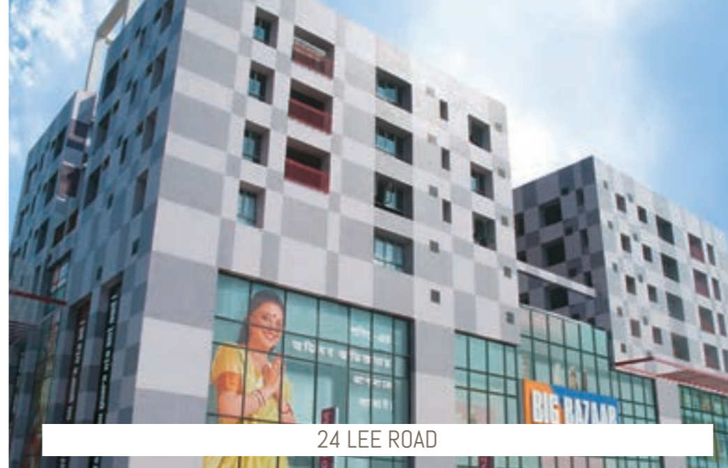
24 LEE ROAD