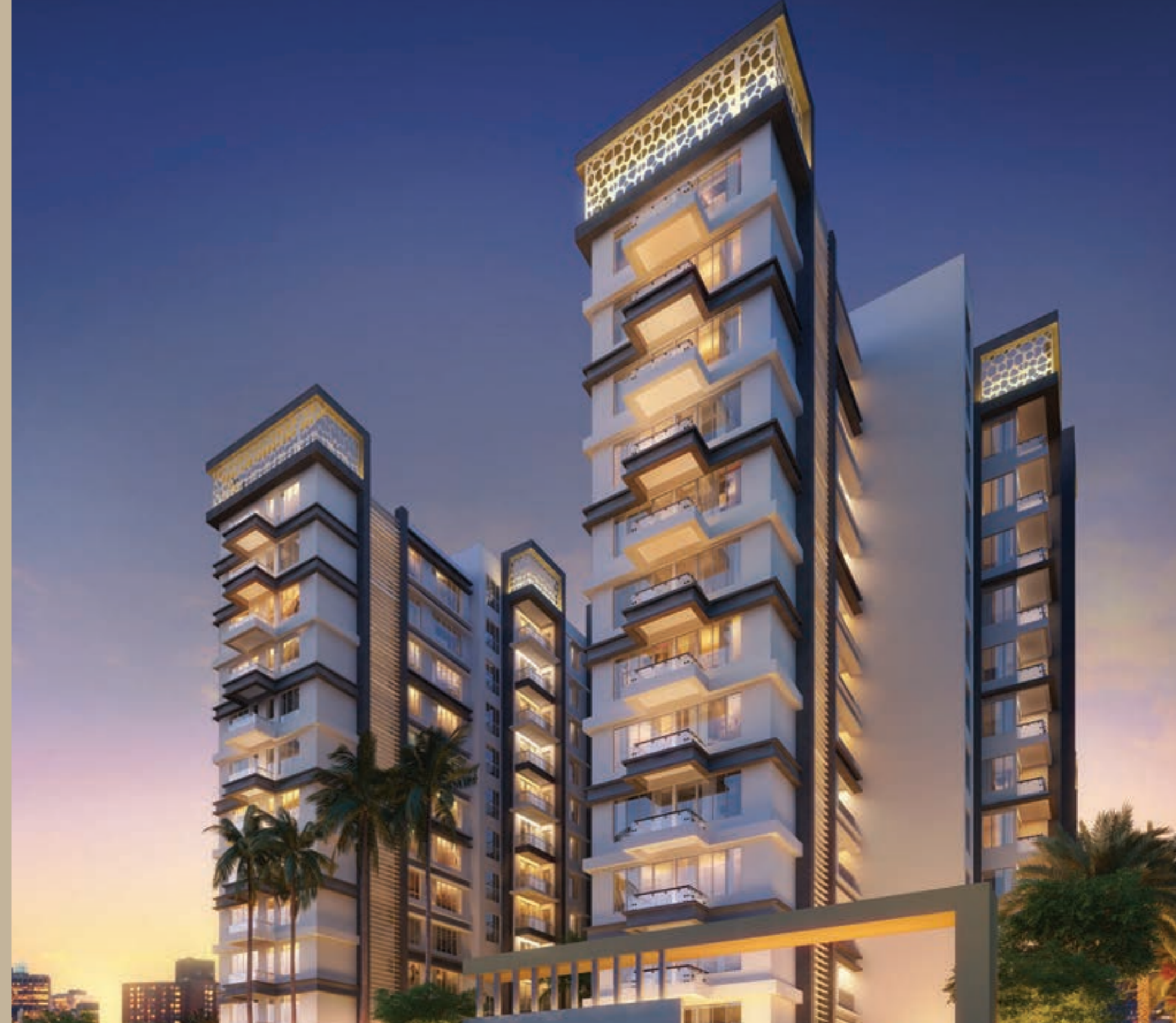
'ECOS', New Town, Rajarhat

Four residential towers G+12 storied Spacious 2, 3, 4 bedroom homes Fully loaded with a world of luxuries All state of the art In prime Rajarhat