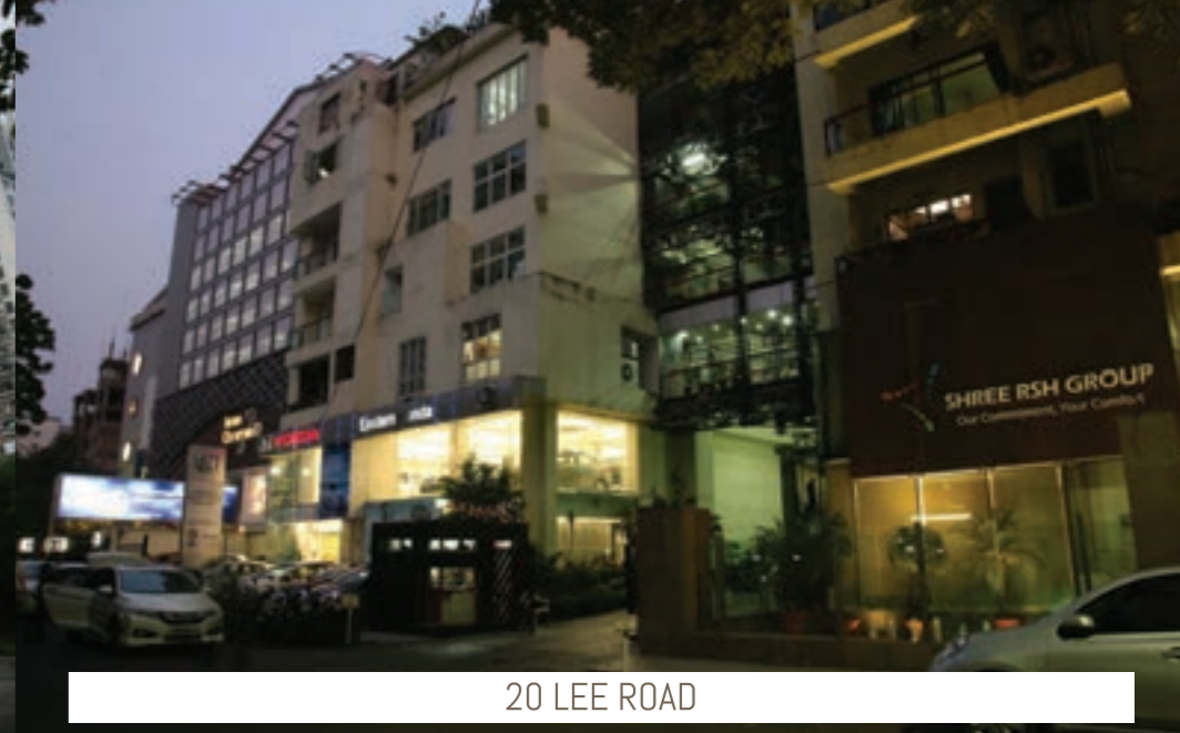
20 LEE ROAD