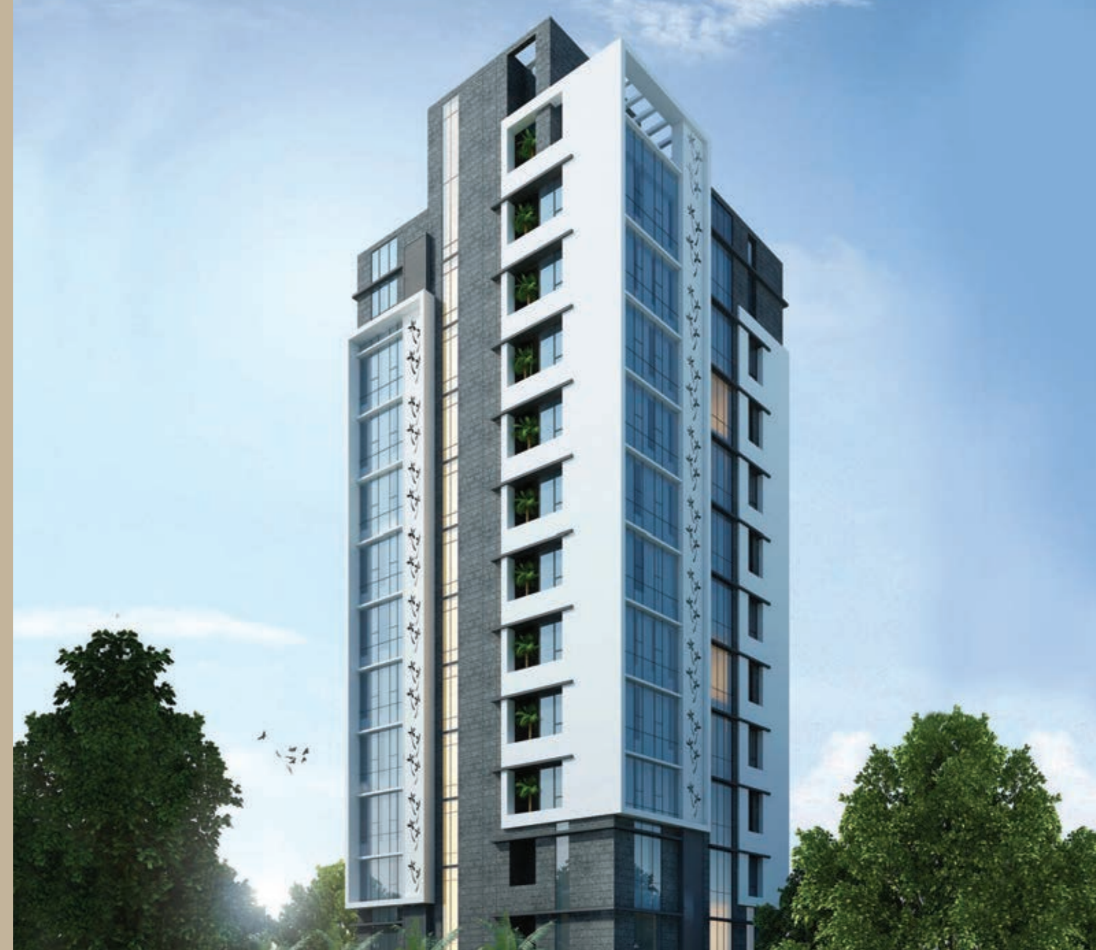
Palm Court, Palm Avenue, Kolkata

Flaunt worthy residences with state of the art luxuries