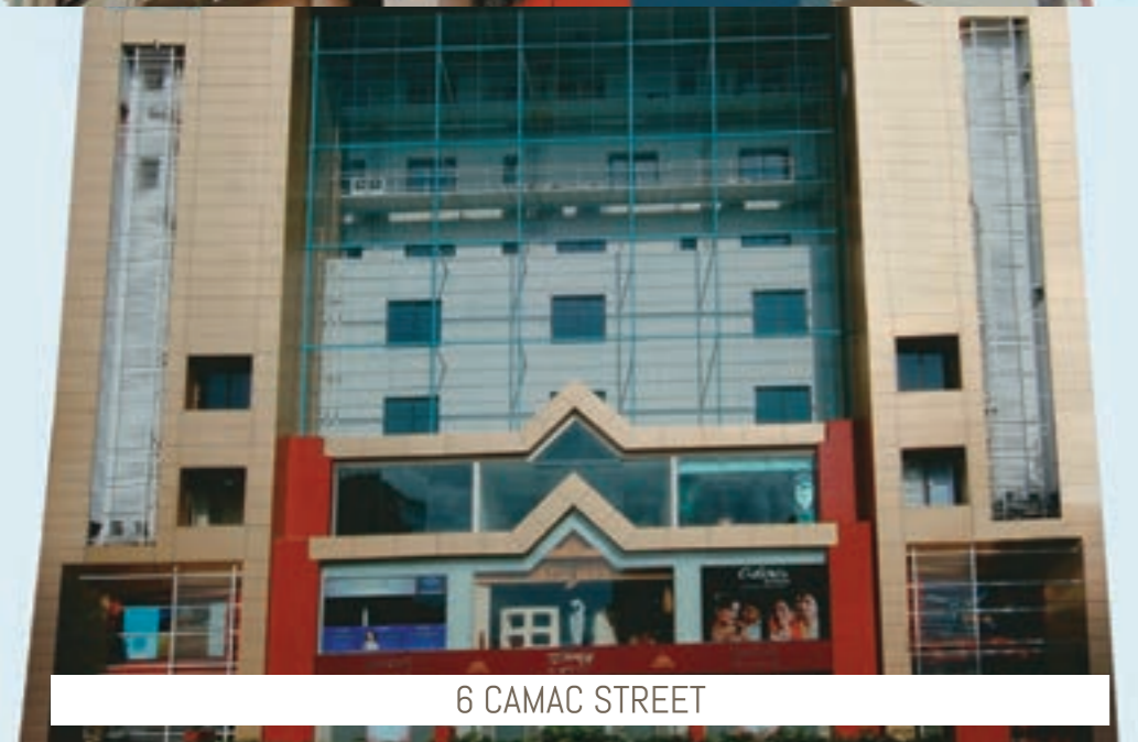
6 CAMAC STREET