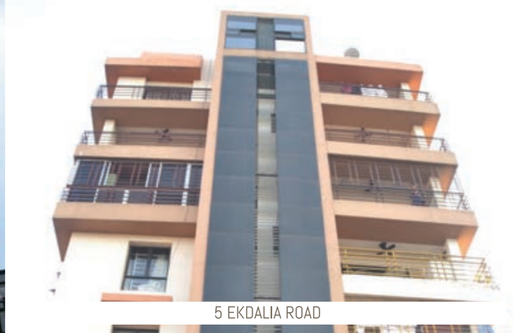
5 EKDALIA ROAD