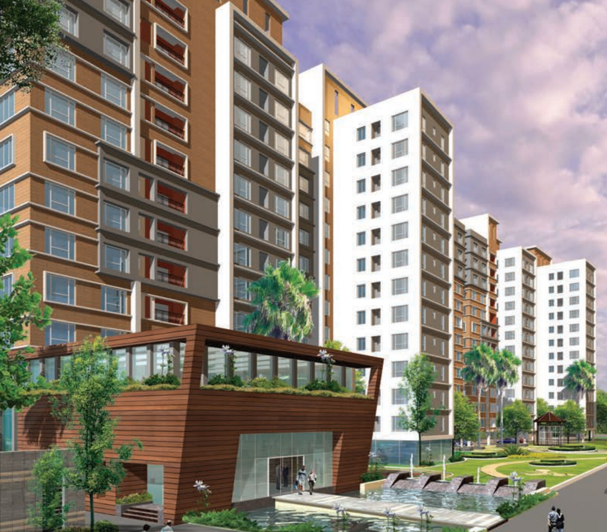
Andul Road, Howrah