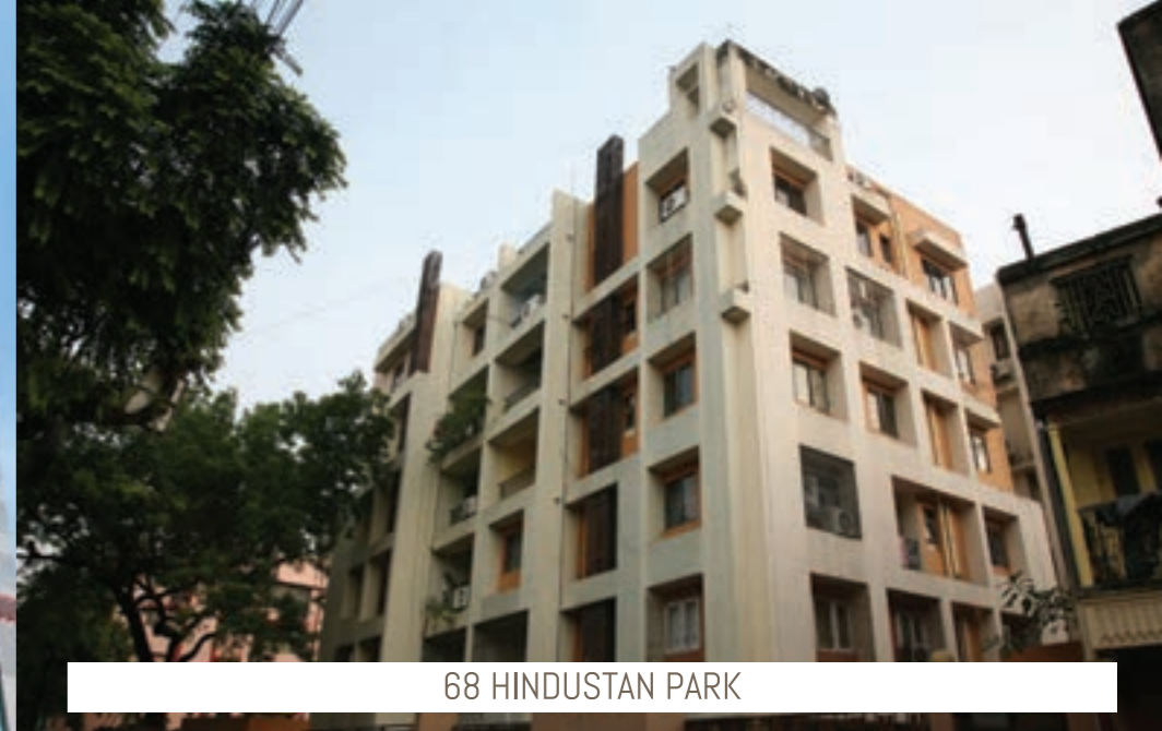
68 HINDUSTAN PARK