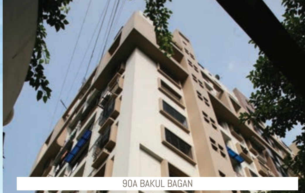
90A BAKUL BAGAN