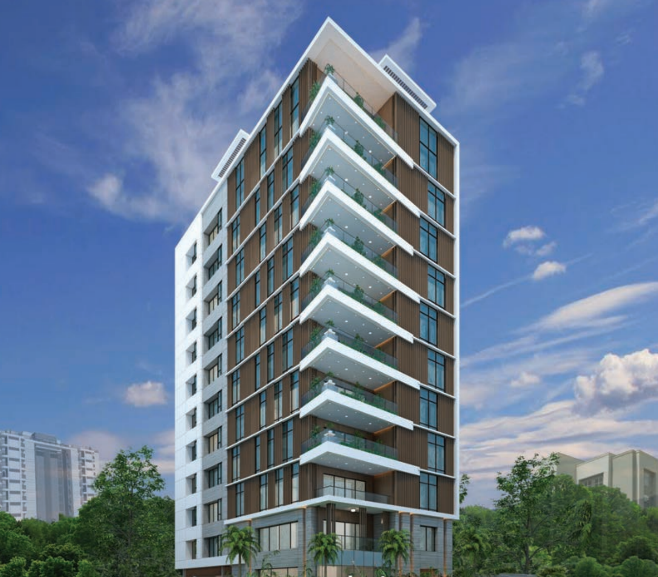
Basil Garden, 33B Rowland Road, Kolkata