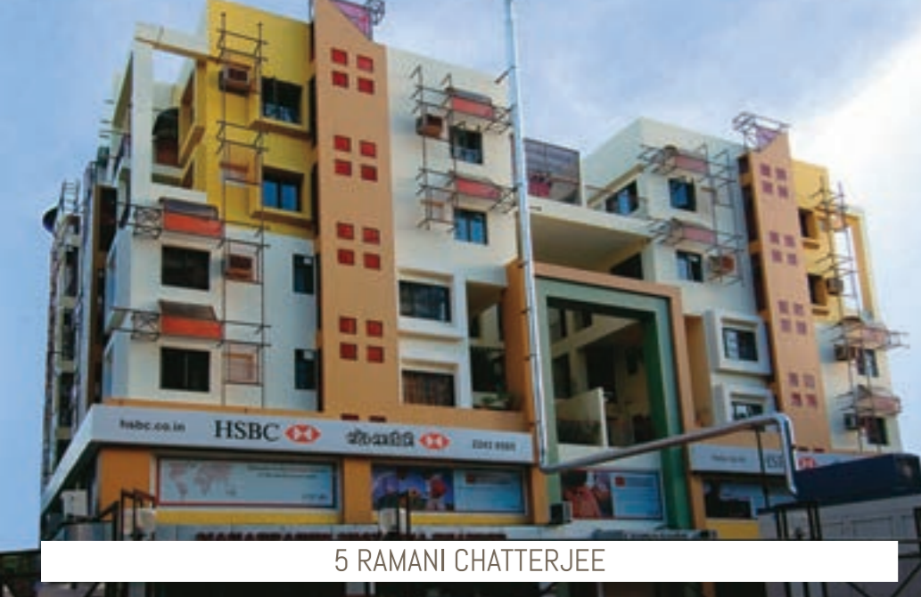
5 RAMANI CHATTERJEE