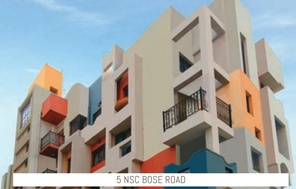
5 NSC BOSE ROAD