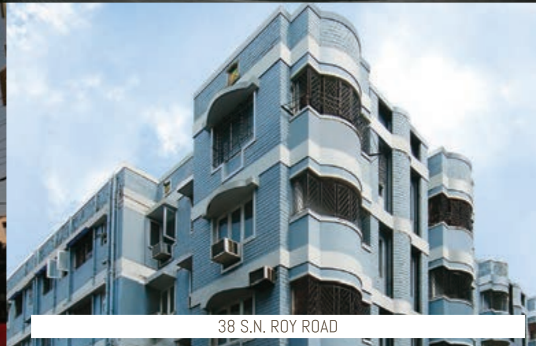
38 S.N. ROY ROAD