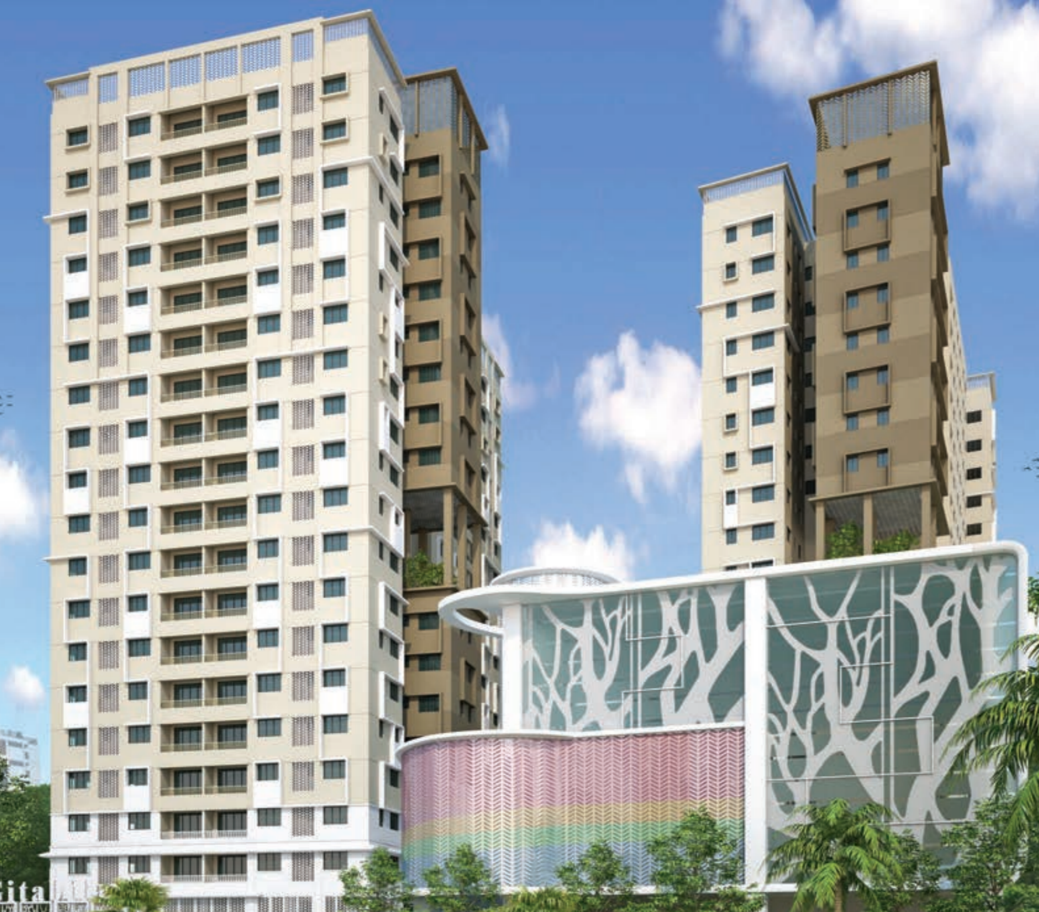
'Gitabitan', New Town, Rajarhat