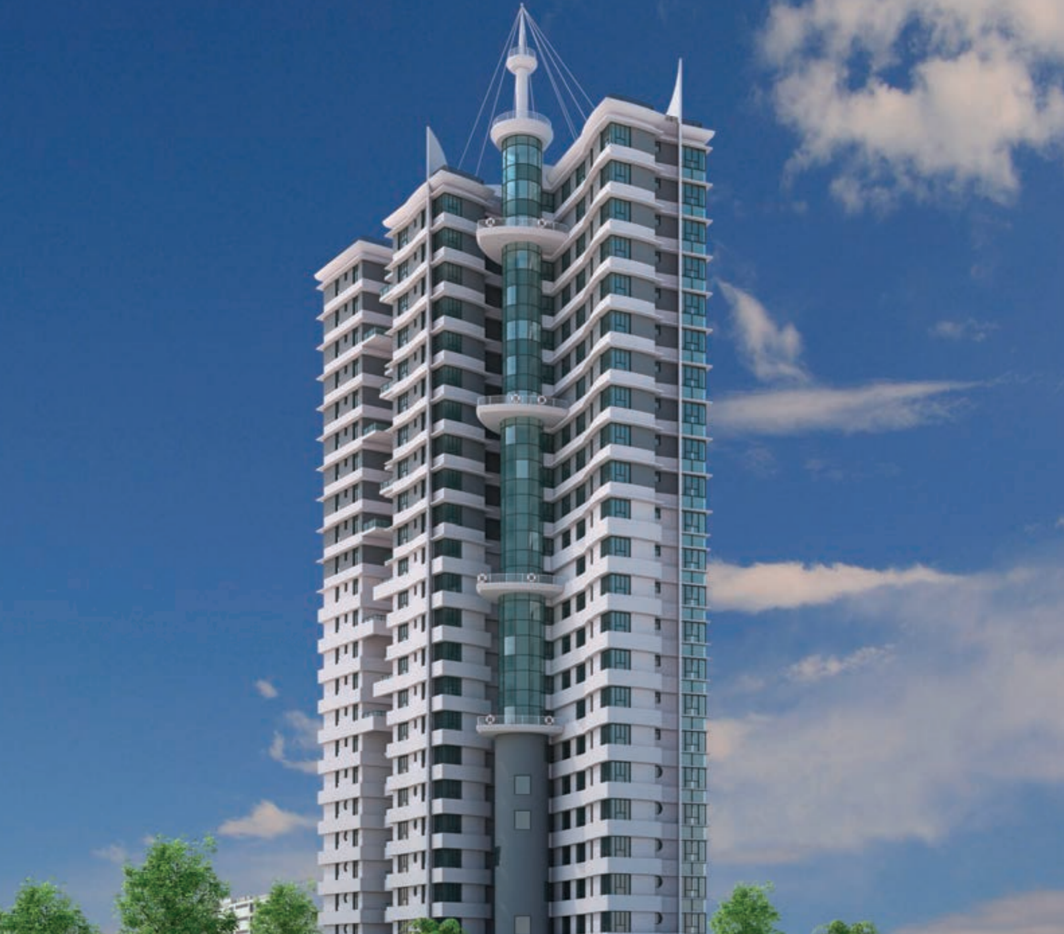
'Prospera', Laskarhat, EM Bypass

Prospera is designed to be the epitome of finest living Located off EM Bypass, the queen's necklace of Kolkata If you're looking for a haven where everything is like you always dreamt, this is it.